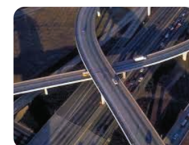
Dynamic Routing and Intelligent Mobility