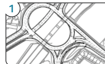
Bermuda Park - A444 Coton Arches