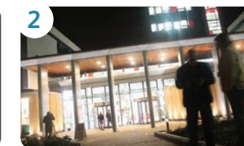
Skills Capital Programme