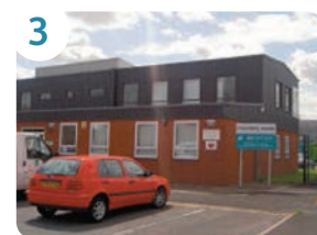
Stratford-on-Avon Start-up Hub £450k 2015/16