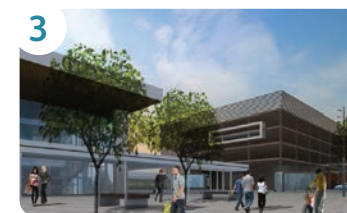
Coventry Station Access Improvements