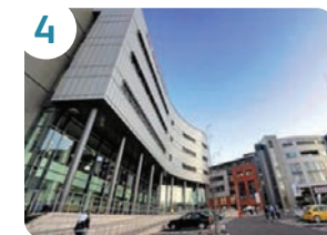
City College Coventry Skills Hub £80k 2015/16