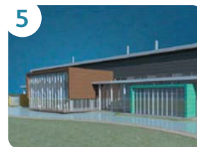
Innovation Grow On Space £4.7m 2015/16 £7m total