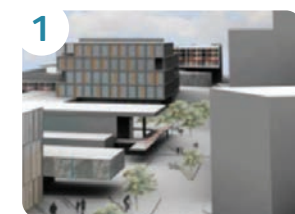
Coventry - Nuneaton Rail Link & Coventry Station £4.9m 2015/16 £20m total

In September 2014, Minister for Universities, Science and Cities Greg Clark MP travelled to Shire Hall in Warwick to sign the Growth Deal to confirm £74.1m of funding, of which £17.2m is for 2015/16.