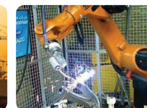
Business Investment Fund