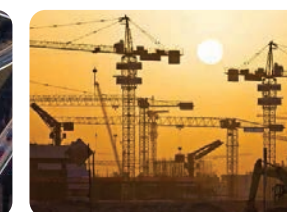
Unlocking Development Sites