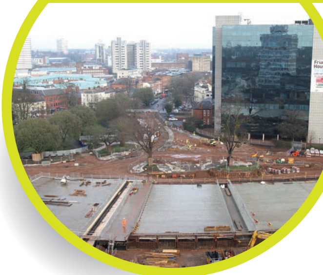
The new bridge deck taking shape as part of the Friargate development in Coventry

It is the first phase of a number of improvements in the area which, when complete, will reduce congestion, improve safety and unlock a number of proposed major new development sites at Gaydon and the immediate area.