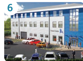
Warwickshire College Apprenticeship Centre £1.3m 2015/16