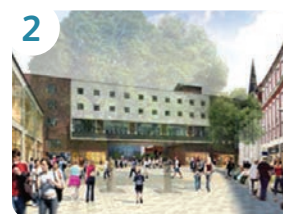
Coventry City Centre Access £5m total